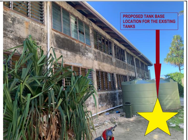
Photo # 1: Proposed base site location for new tanks Photo # 2: Proposed base site location for the existing tanks